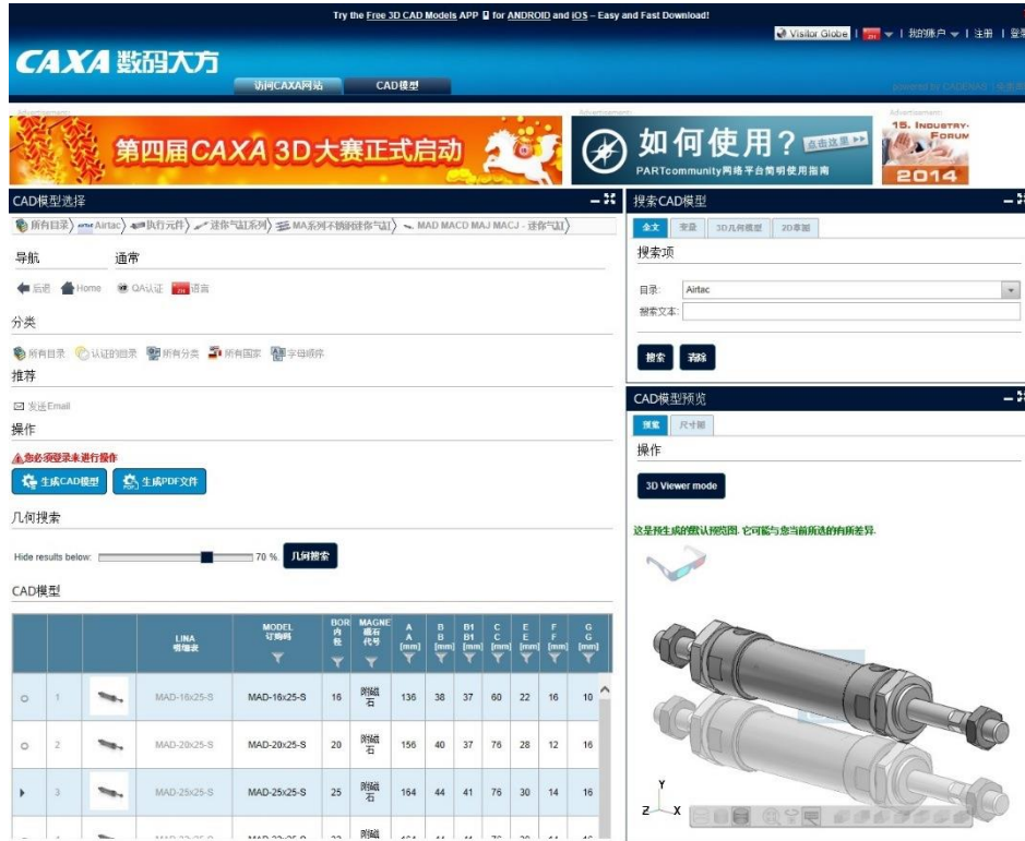
Caption: Via the Community portal designers get immediate access to millions of 3D CAD models they can configure and download for free.